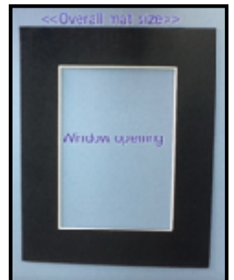
Image of Matting for works under glass and our "unframed artworks" section. Note the bevel edge. →

← Framing tape available in various widths from a framing shop or on line